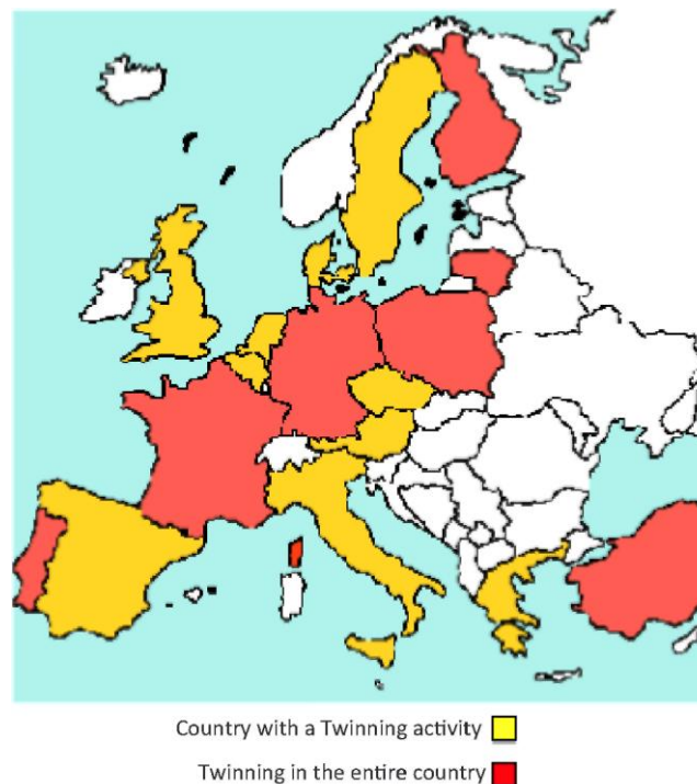
FIGURE 1 Twinning of the Allergy Diary in EIP on AHA Reference Sites (15-11-2016) [Colour figure can be viewed at wileyonlinelibrary.com ]

The Allergy Diary is a CE1 medical device and does not require ethical approval. An ethical agreement has been approved by a German ethics committee for the questionnaire. This ethical agreement will serve for all EU countries.