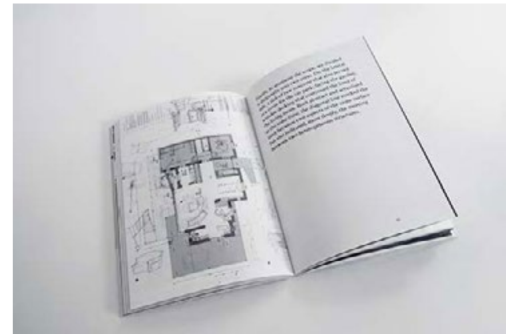
Figure 4 P 84 p85

Page 85, a short text defines states a design principle : a line will separate two surfacic materials. This diagonal line seems arbitrary, which positions it as the assertion of a principle. The series of plans, which aimed at the application of established principles to the entire house, produces here a new principle, which is given back to the project. The existing house and the extension will be identified by a very thin line, a delimitation between two similar materials, regardless of the window openings, like an arbitrary line, reinforced by partial window shutters deconstructing views. The linearity of the process has been broken through this feedback, the sequence of the plans can be ended now.