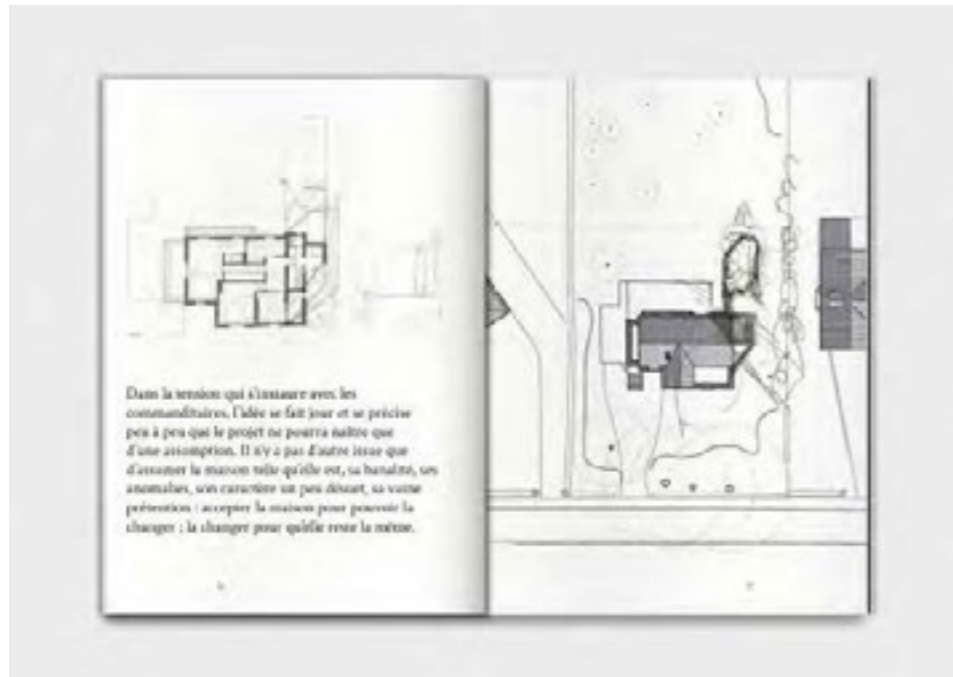
Figure 3 p24, p25, picture by Mer Paper Kunsthalle

The unusual scale of the typography of the book “Never Modern” 9 about 6a architects also modifies the relationships of text and illustration in the book which is not the receptacle of a content, but an object in itself : re-laying out would essentially alter its content. In the case of In Practice , this shift in scale fulfills a multiple agenda : the book as an object, sequences engaging specific relationships and reflections, the meta-level of the In Practice ambitions.