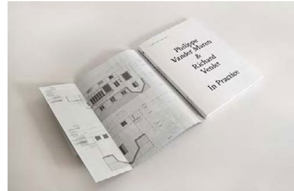
Figure 2 Book Cover, picture by Mer Paperkunsthalle

The cover of the book is a folded poster on which the as-built plans are reproduced on one side; the very essence of a neutral, professional, objective representation according to shared standards and procedures within the field. The other side represents a detail photograph of the realized building by photographer Jeroen Verrecht : maybe the most extreme form of a subjective, poetic, interpretative representation. Two faces of the same reality, which the book will attempt to unveil trough close objective observation and subjective accounting of the process.