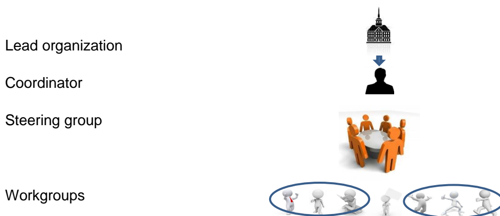
Figure I: Vertical network structure

These structures appear to have an important function within the network. We find that, by installing a steering committee, a workgroup or by hiring a coordinator, the opportunity for the network partners to provide input, increases.