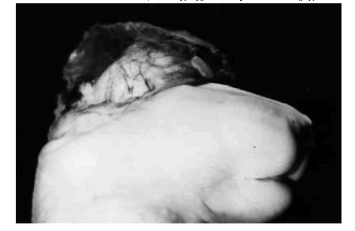
Fig. 1: Mouse fetus from a dam treated with DON (3.3 mg/kg) on days 7 and 9 of gestation showing exencephaly