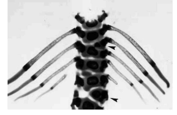
Fig. 3 : Complex rib fusions (arrows) with a distal duplication. Such deformities are associated with various vertebral deformities such as those illustrated in Fig. 2

Fig. 2 : Vertebral body fusion associated with a hemivertebra (upper arrow) and a further hemivertebra (lower arrow). Note the asymmetric last ribs and an isolated cartilaginous nodule between two vertebral bodies