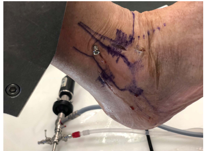
Figure 3 Screw fixation image showing how the screw was positioned (2-cortical, between 2 cm and 4 cm proximal from the tibiotalar joint and aimed at 30° of anterior angulation).

to calibrate and assure measured accuracy based on 0.1 Newton. The measurement was performed first with the syndesmosis intact, then with subsequent cutting of the AITFL, the IOL and the posterior inferior tibiofibular ligament (PITFL)(figure 2). The force required to enter the 4 mm shaver tip, 1 cm proximal to the distal tibiofibular joint was measured.