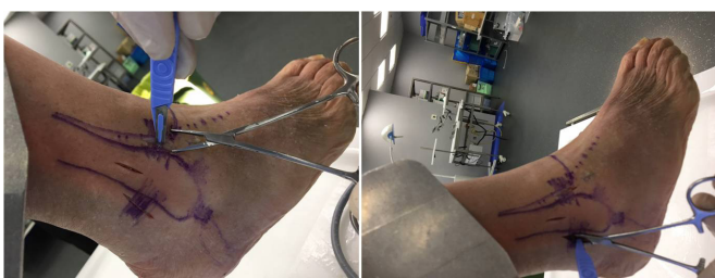
Figure 2 Ligament transections: Presentation on how the anterior inferior tibiofibular ligament and posterior inferior tibiofibular ligament are cut prior to testing.

A total of 16 freshly frozen cadaveric (age range, 58–74 years) ankles were used for this study. Foot and ankle specimens were secured using a clamp and the standard arthroscopic portals were established (figure 1). An intra-articular view was established to visualise the anterolateral tibiotalar joint as the shaver was inserted into the distal ankle syndesmosis (figure 1). A dynamometer (Aspetar Model 12–0343, 2017) was adjusted to a 4 mm arthroscopic shaver to measure the force necessary to enter a 4 mm shaver tip 1 cm above the tibiocrural joint line in the distal syndesmosis with the ankle in a neutral position during arthroscopy (figure 1). The dynamometer was trial tested