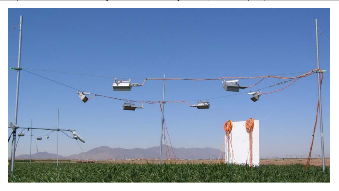
Figure 1. Photograph of the infrared heater system. In the centre foreground, infrared heaters are arranged in a circle above a wheat crop (Heated plot), and in the background to the left, the dummy non-operable heaters are arranged in a similar configuration (Reference plots).

The crops were irrigated at 100% replacement of potential evapotranspiration to maintain the soil water content at field capacity. Depending on planting date, the total amount of irrigation ranged from 362 to 921 mm. Water was supplied through a surface drip tape irrigation system with drip tapes placed 38 cm between every other row. Heated plots received 8% to 10% more water as a separate supplemental irrigation (except for the first planting on 13 March 2007) to provide a first-order correction for the increased plant-to-air vapor pressure gradient (Kimball, 2005). To guarantee good germination and emergence of the summer planted crops, additional sprinkler irrigation was provided. Soil fertility was managed to avoid nutrient limitations. Fifty to 56 kg N ha<sup>-1</sup> and 67 kg P_2O_5 ha<sup>-1</sup> were applied as granular ammonium phosphate at planting, and urea ammonium nitrate was subsequently applied in irrigation water at rates of approximately 50 kg N ha<sup>-1</sup> per application with up to four applications (at tillering, heading, anthesis and during grain filling) depending on crop requirements.