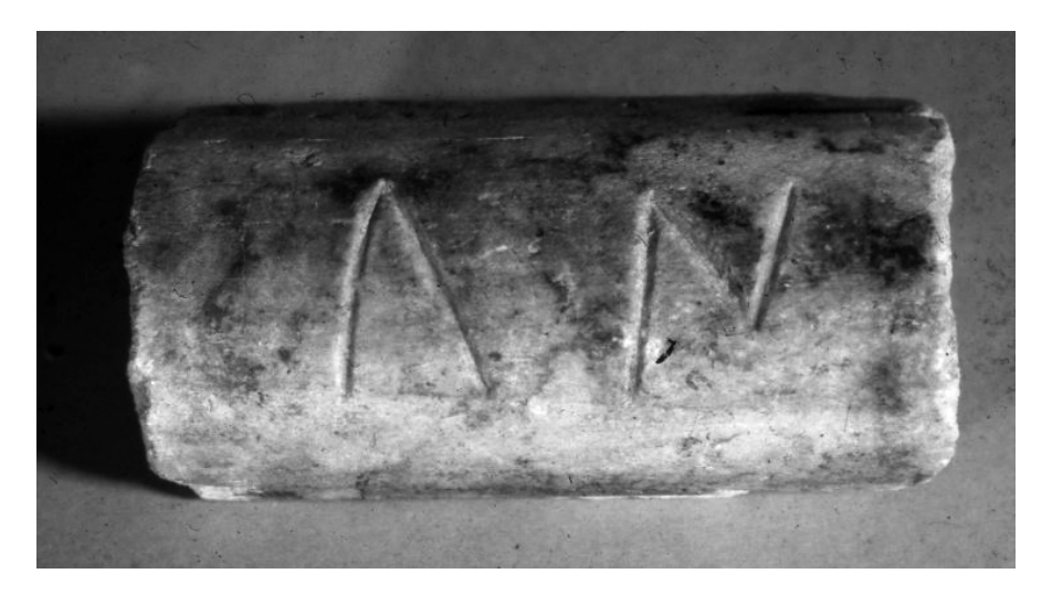
Fig. 2. One of the four fragments (from the top of a marble column) with Greek inscriptions that can be read as "King Croesus dedicated (this)". London, BM 1872,0405.19.

The Lydian inscription is more problematic (Fig. 3), because it is only a small fragment of a marble drum also from the archaic temple.