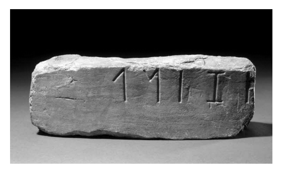
Fig. 3. Top of a marble column-drum with a Lydian inscription from the Artemision of Ephesus. London, BM 1874,0710.121.

The Lydian inscription is more problematic (Fig. 3), because it is only a small fragment of a marble drum also from the archaic temple.