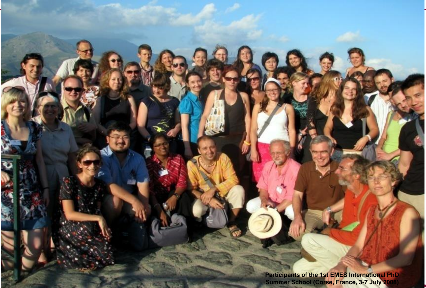
Participants of the 1st EMES International PhD Summer School (Corse, France, 3-7 July 2008)