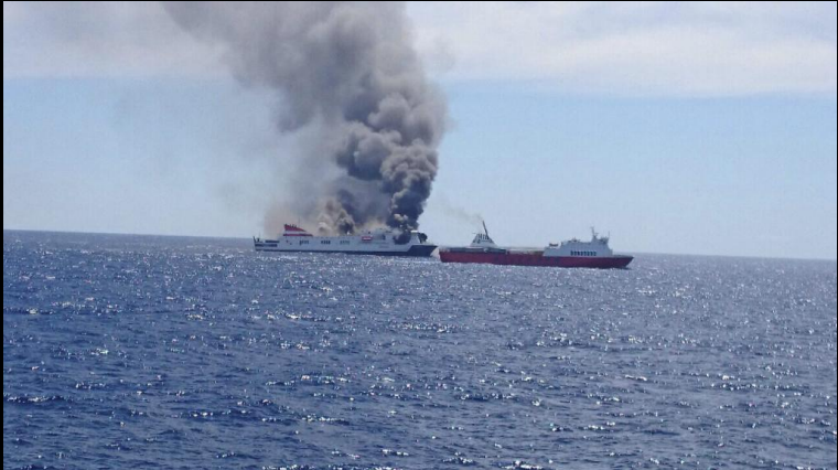
Sorrento ferry on fire, 17 miles west of Mallorca, April 28, 2015