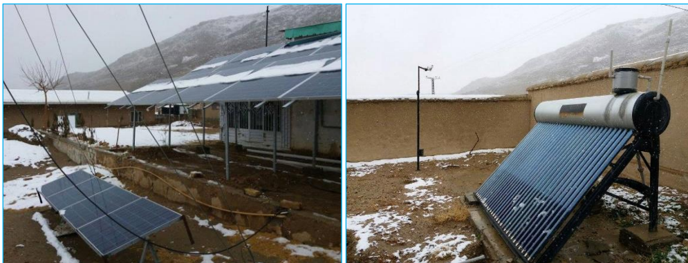
Figure 3(a) and 3(b). Solar Panels and solar water heater installed at IDSP's UCD campus

the campus to light the indoor and outdoor areas. The produced solar energy is stored on rechargeable batteries and is also used to operate water pumps used in the campus.