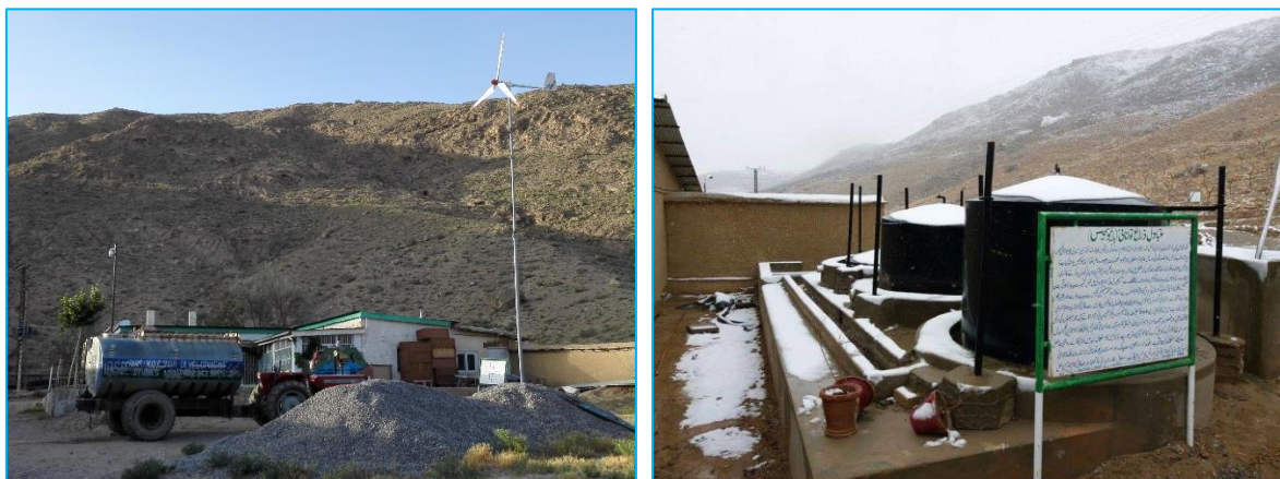
Figure 4(a) and 4(b). Wind turbine and biogas plant at UCD campus

Wind turbine used at UCD campus produces up to 10 kW of electricity at its optimum wind speed and it has been a successful project for over ten years of its installation. Moreover, biogas plant is also installed at UCD campus to fulfil the demand of cooking needs [20].