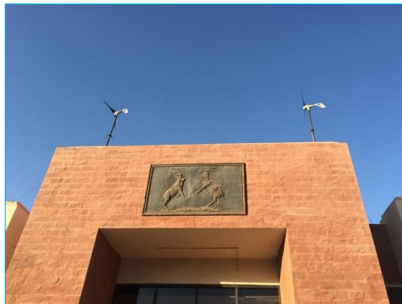
Figure 5. Small wind turbines still intact to the building of Department of Architecture, BUITESM Quetta