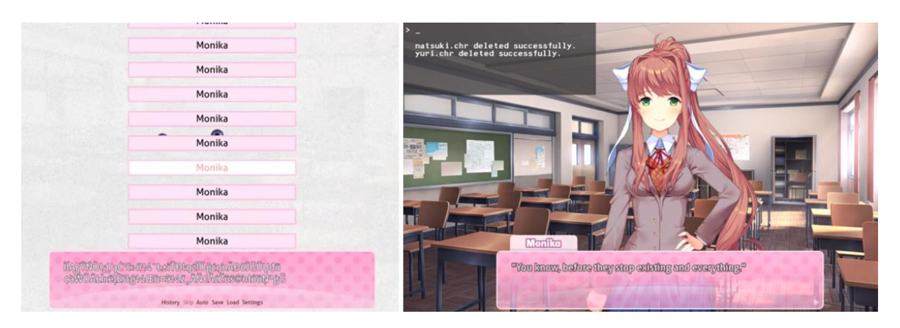
Figure 6 - Screenshots of Monika letting no choice to the player and deleting the other characters

Likewise, some lines suggest that Yuri and Natsuki fear Monika and that the president is actually aware, on a meta level, of the game's functioning. Gradually, Monika's presence will become more and more invasive: she starts to stand before the game's interface, she tries to force the player to select her by replacing all the choices by her name, her sprite appears transparently on top of the other characters, etc. Finally, the events lead to the suicide of Yuri (who stabs herself to death either by over-excitement or by despair, depending on the player's answer to her feelings), following which Monika decides to simply delete Yuri and Natsuki's character-files from the game folder and to restart the game again in order to finally be alone with the protagonist.