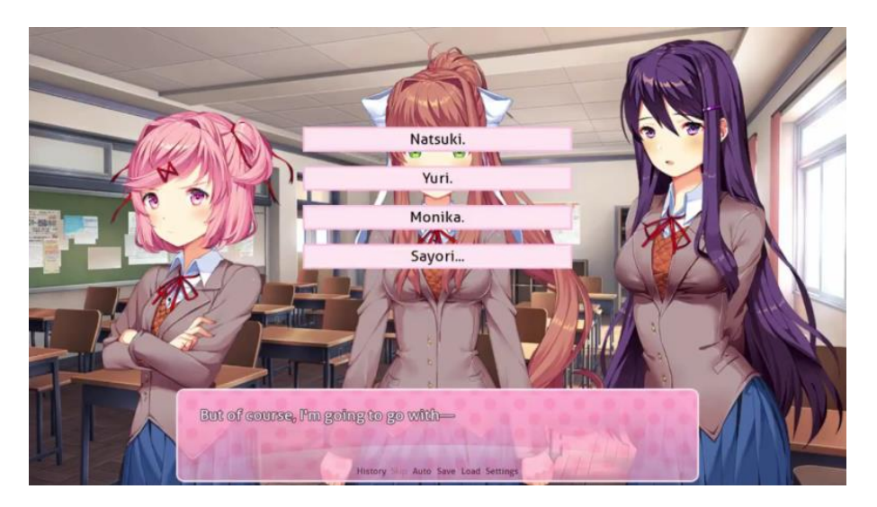
Figure 9 - The only dialogue box allowing to select Monika's name is actually a fake choice, since only Yuri and Natsuki are really available

The player's powerlessness is also underlined by the fact that, although Monika explicitly asks him to choose her on the download page (and several times during the game), this choice is actually impossible, since the player cannot write a poem for her or even make dialogue choices in her favor: the only time a dialogue box allows to select Monika's name, Yuri and Natsuki will prevent the choice to be effective (if the player tries to select it) by asserting that Monika does not need the protagonist's help.