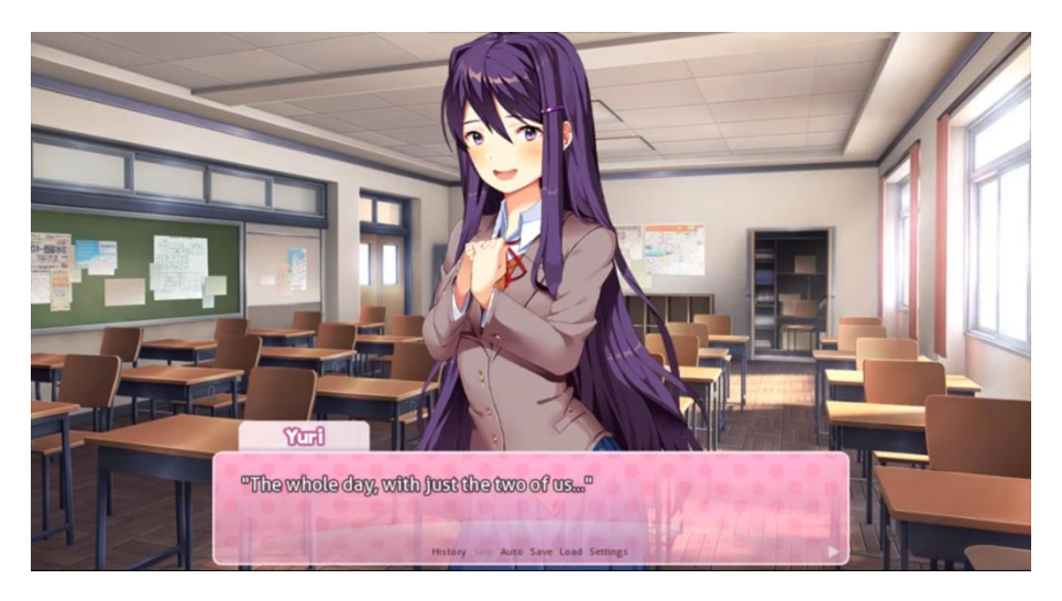
Figure 10 - In the second act, Yuri develops an obsession for the main character

Similarly, even if the player's choices can unlock various scenes with the character who appreciates his poems the most, this meager choice is denied in the course of the second act: not only Monika is still not eligible (and Sayori is gone), but, if the player tries to seduce Natsuki by choosing her words in the poetry-writing mini-game, the following scenes will still mostly feature Yuri, since she monopolizes the protagonist because of the pathological obsession she developed for him.