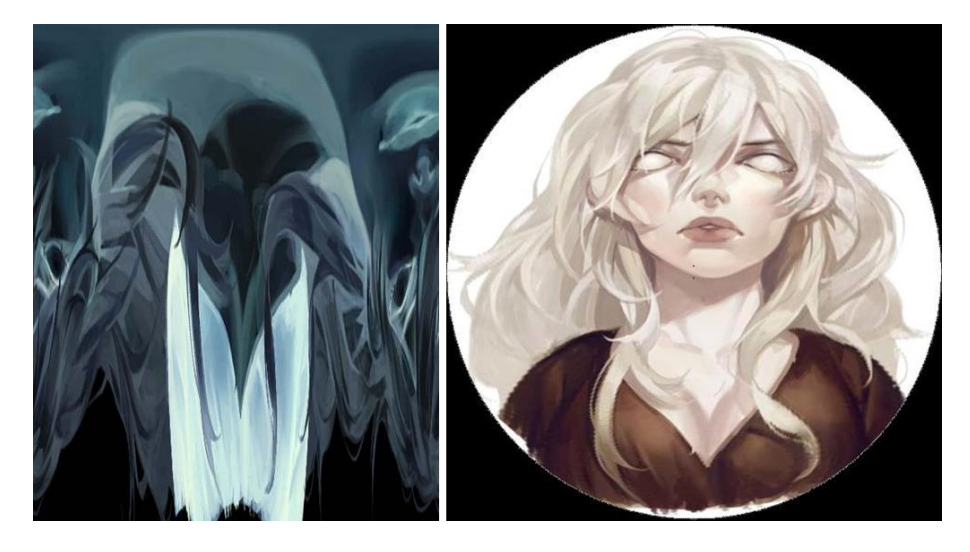
Figure 13 - natsuki.chr before and after transformation

This type of hidden puzzles pushed players to dissect the game folder and allowed them to discover more and more clues about this mysterious parallel story. Besides, all of these clues (evoking the cult, the Project Libitina and the Third Eye) have been interpreted by players as part of a vast "alternate reality game" announcing the next title developed by Team Salvato (although there is no confirmation of this interpretation yet). These elements therefore intertwine narrative functions (the puzzles' contents are intradiegetic, although paratextual), gameplay functions (since they formed the framework of an investigation game) and possibly advertising functions (thus giving information about the developer's empirical world).