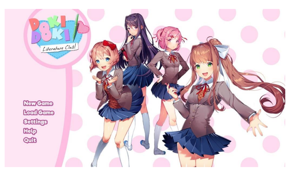
Figure 1 – <u>DDLC</u>'s title screen

On the download website<sup>5</sup> or in the first part of the game, multiple paratextual signs refer to a <u>kawaii</u> aesthetic (dominance of rose, presence of hearts or circles patterns, cheerful trailer and musical introduction, naive slogans<sup>6</sup>, thumbnails of characters in super-deformed version, etc.) and build the reading pact of a classic romantic visual novel. The only incongruous element in this paratextual device is a strange warning that is discordant when compared to the other texts framing the game. It states that: "This game is not suitable for children or those who are easily disturbed".