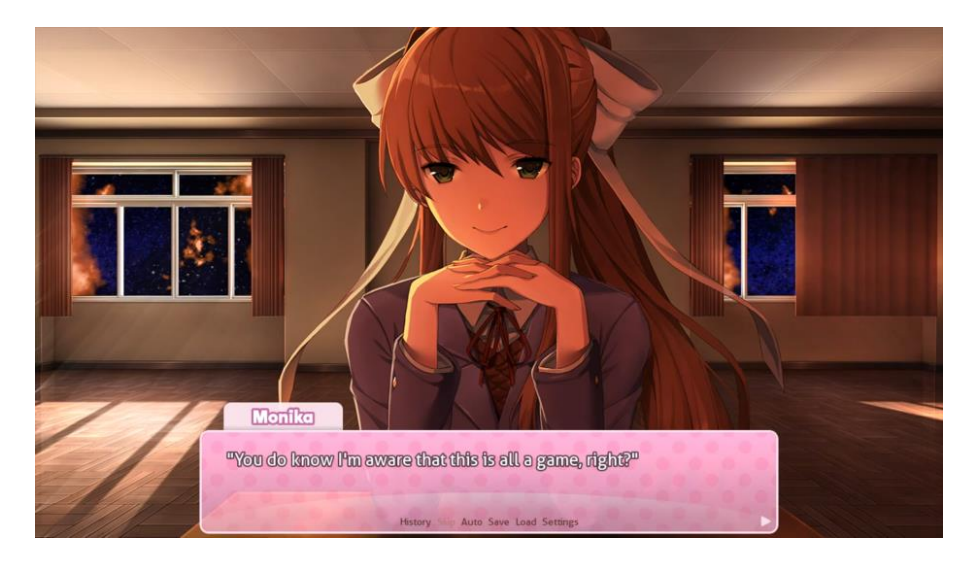
Figure 7 - Game screen when the player is trapped with "Just Monika"

his characters from it"<sup>11</sup>. In this scene, among others, Monika admits being aware that she is a game character and calls the player by his computer's username; she also mentions having written the text of the game's download page (where she asks the player to spend the most time with her<sup>12</sup>) and, if the player is recording the game with a screen capture software, she will detect it and try to jump-scare her audience as revenge for being watched, etc. At this point, the player is trapped with her while she only emits random lines of dialogue at regular intervals<sup>13</sup>. In order to get out of this situation and access the game ending, the only option left to the player is to open the game folder and delete Monika's character-file.