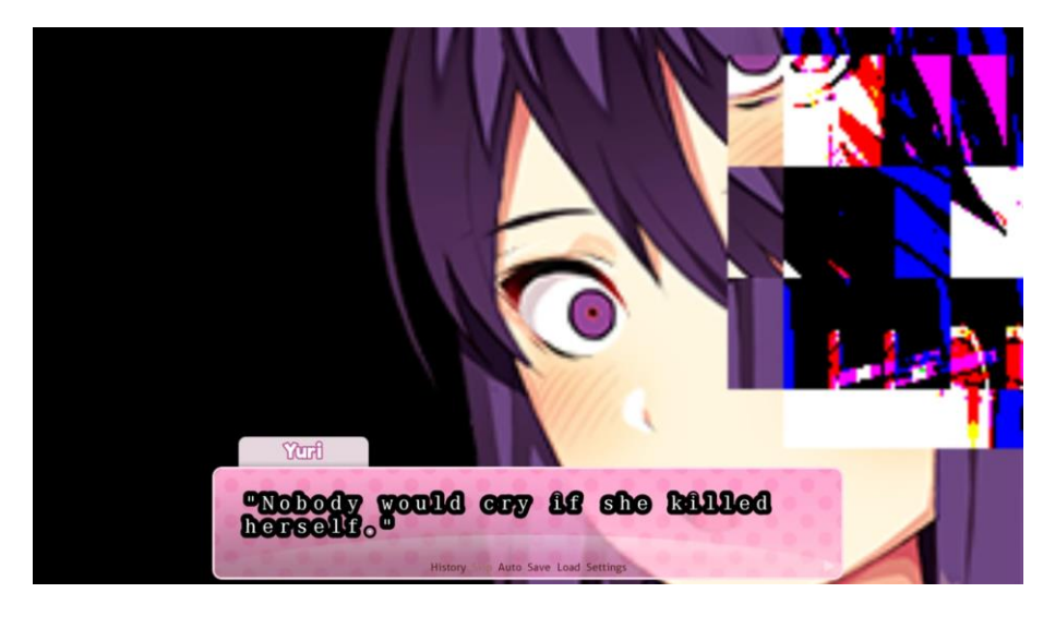
Figure 5 – Screenshot of Yuri during the appearance of a glitch

Likewise, some lines suggest that Yuri and Natsuki fear Monika and that the president is actually aware, on a meta level, of the game's functioning. Gradually, Monika's presence will become more and more invasive: she starts to stand before the game's interface, she tries to force the player to select her by replacing all the choices by her name, her sprite appears transparently on top of the other characters, etc. Finally, the events lead to the suicide of Yuri (who stabs herself to death either by over-excitement or by despair, depending on the player's answer to her feelings), following which Monika decides to simply delete Yuri and Natsuki's character-files from the game folder and to restart the game again in order to finally be alone with the protagonist.