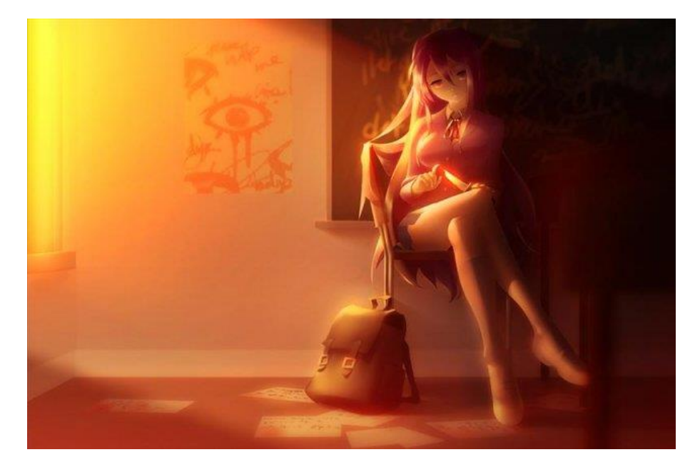
Figure 14 - A poster of Yuri sold on DDLC's merchandise store and referring to the Third Eye

Similarly, if the player remains listening to Monika in the last part of the game, she will eventually reveal that she has a Twitter account. Yet this account has been operating since February 2017, <u>i.e.</u> several months before the game release (in September 2017), and is still active currently (it periodically publishes "tweets" that are in agreement with Monika's personality). This page can be considered as part of <u>DDLC</u>'s expanded playground, since it has not only been used to deliver clues about the Project Libitina, but it has also triggered some kind of widespread role-play, as <u>DDLC</u> players regularly try to interact with Monika on Twitter as if she were real. Moreover, several fans have continued the trend by creating accounts for the other characters (including for the Protagonist) and play their role on the social media, either by trying to catch Monika's attention or by interacting with each other.