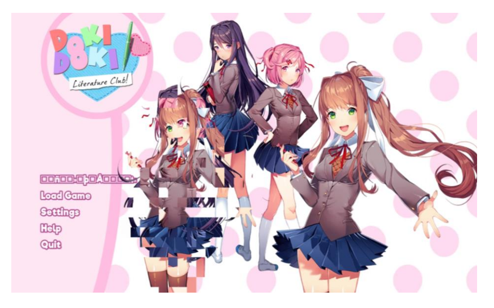
Figure 4 - Title screen after Sayori's death

After about two to three hours of play under these conditions, a plot twist radically turns the game into another genre – passing from the high school romance to the psychological horror. Regardless of the choices made by the player (and even if he devotes the entirety of his time to her), Sayori's mood will gradually deteriorate. After confessing to the protagonist that she has always been seriously depressed, Sayori will miss the activities of the club and leave a very disturbing poem<sup>9</sup>, which will alert the avatar. He thus rushes to her house, but arrives too late and discovers that she has committed suicide by hanging herself. The screen then begins to distort heavily and the game starts to reveal graphical glitches and error messages. After a brief display of the text "End" on a black screen, the game reboots, but Sayori disappeared from the title screen and is replaced by graphic glitches formed from the other three characters' sprites. The player no longer has access to his old saves (they have been deleted) and, if he restarts the game, the story will proceed without Sayori, as well as with some notable differences.