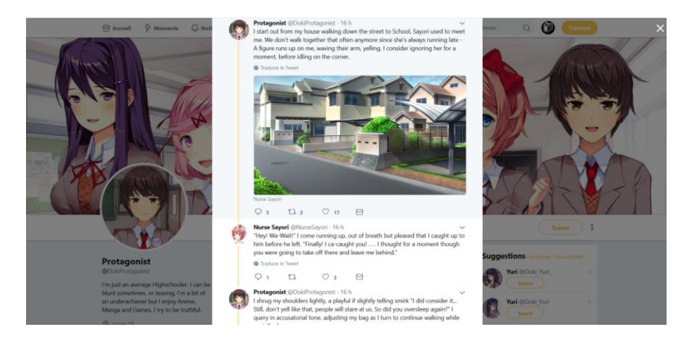
Figure 16 - An interaction between two fan-made accounts (for the Protagonist and Sayori)

In summary – using Salen and Zimmerman's terms<sup>29</sup>: if <u>DDLC</u> may lack "Explicit interactivity" (<u>i.e.</u> "interaction' in the obvious sense of the word: overt participation [...]"<sup>30</sup>), the device is nevertheless a fertile support for "Beyond-the-object-interactivity; or participation within the culture of the object"<sup>31</sup>. From investigation to roleplay, several alternative modes of engagement with the game have been developed by players (many of which find their germs in the device).