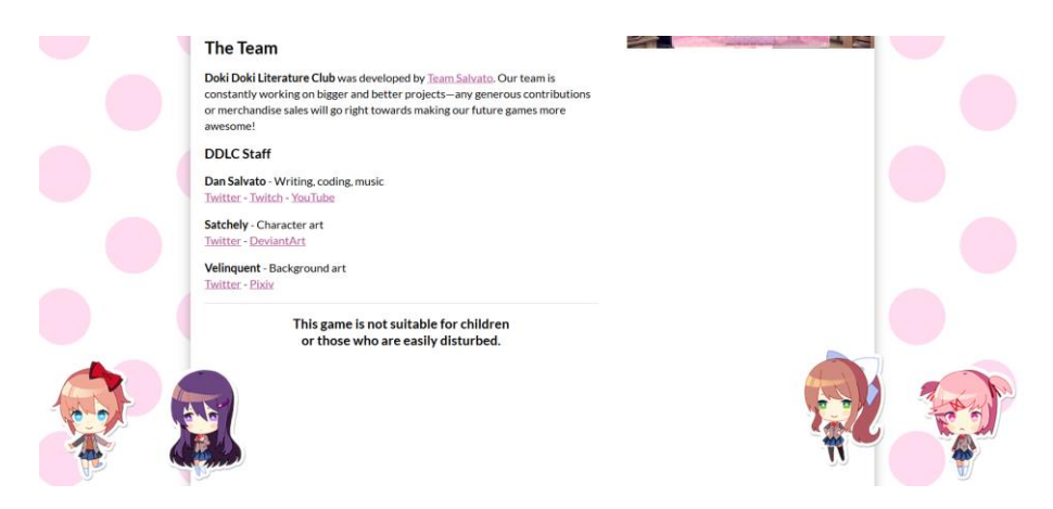
Figure 2 - Screenshot of <u>DDLC</u>'s website, ending with the message "This game is not suitable for children or those who are easily disturbed"

The game is actually divided into two parts: the first one truly conforms to the dating sim genre, both in terms of gameplay and narrative. The player controls (from a first-person perspective) a high school student who enters a literature club composed of four female archetypes: Sayori, the childhood friend of the protagonist, is cheerful, enthusiastic and caring about others, but a little childish, naive and clumsy; Natsuki (who corresponds to the trope of the <u>tsundere</u>) has a stronger temperament and seems to reject the protagonist at first, but conceals the feelings she undeniably has for him; Yuri (who is close to the <u>dandere</u> trope) is shy, reserved and mature, but has trouble