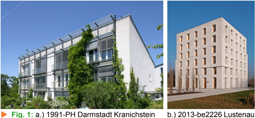
Fig. 1: a.) 1991-PH Darmstadt Kranichstein