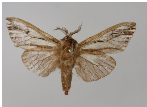
Figure 3: Eumeta cervina Druce, 1887: wingspan 38 mm, Zambezi Rapids, Ikelenge, Mwinilunga (Zoologische Staatssammlung München).

Distribution.- Mocambique: Delagoa Bay (locus typicus), Montero, Rikatla, Lourenço Marques