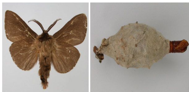
Figure 4: Male (left) and male bag (right) of Deborrea malgassa Heylaerts 1884: wingspan 35 mm, Madagascar, Antokazo near Ambatosoratra, Lac Alaotra (Zoologische Staatssammlung München).

Despite their similar patterns, species status within the genus Deborrea is much clearer than within the genus Eumeta because of all species were