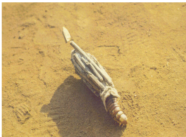
Figure 2: "La pisseuse" ( Eumeta sp.), Ndongué village, Gbaya 'Bodoe ethno-linguistic group (Central African Republic).

for children' nocturnal enuresy whilst the sheath, is keep as "lucky charm" for those that are beginning a trade. This ethnospecies belongs to Eumeta sp.