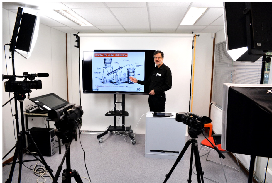
Figure 1. Recording environment

To reach these goals especially different lighting setups have been tested. Optimal quality was finally reached by using a large TV screen for projecting the presentation slides and to use a tablet or convertible with a suitable writing program for presenting the derivations. This is shown exemplarily in Figure 1. This way also a direct interaction between presenter and presentation is apparently easily possible and derivations can be recorded from the same TV screen. Sound recording is performed with a condenser microphone and a recording device which allows wav-recording with 24-bit resolution.