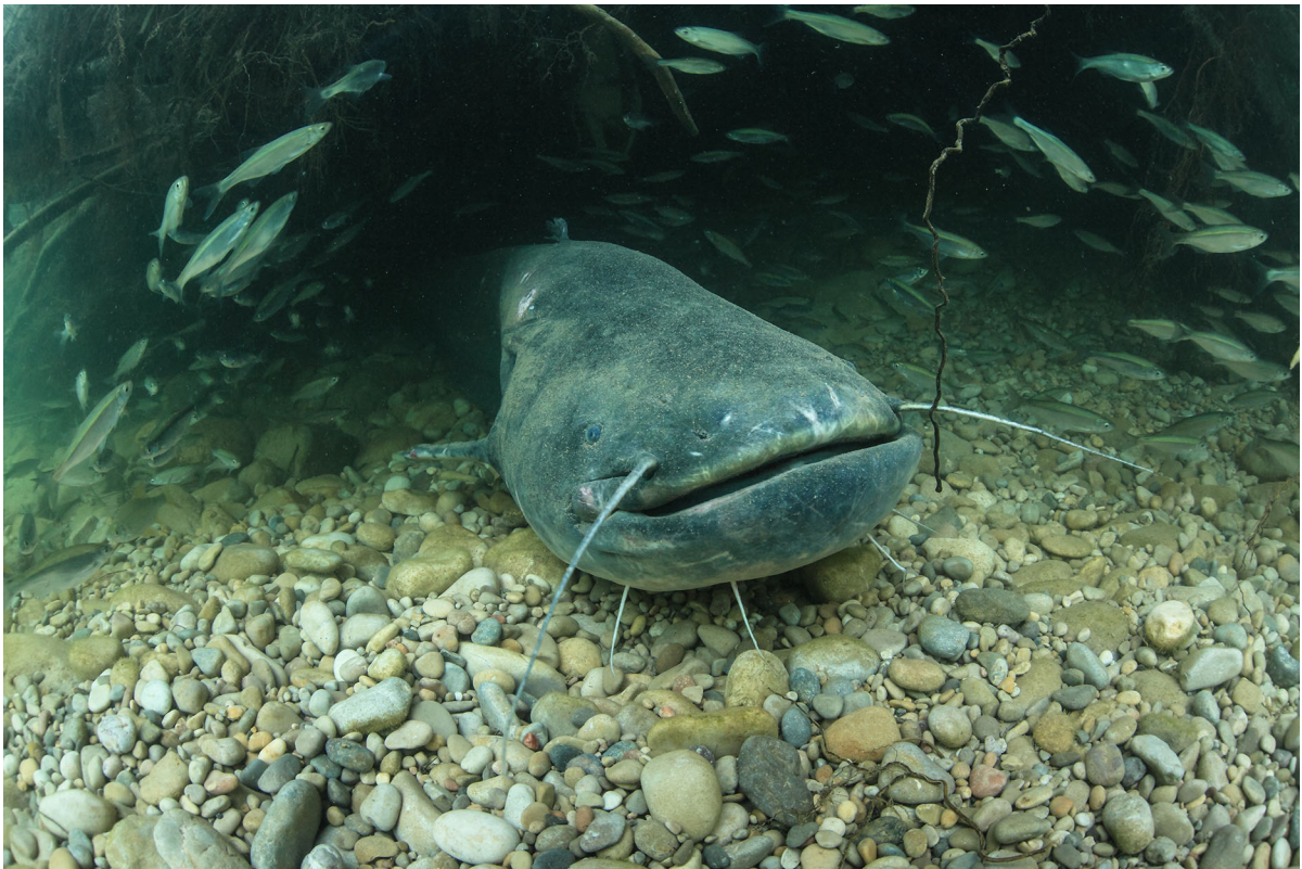
Fig. 2 A large, close to 2 m long, European catfish ( Silurus glanis ) in a natural Southern European river.

interaction of diel cycle and temperature only partially explains some of the behavioural patterns of European catfish, with use of electromyogram (EMG) tags showing that there is considerable individual variability in behaviours. For example, some tagged individuals had energy utilisation patterns that showed little pattern with the phase of the diurnal cycle, with peak activity use during specific periods of the day or the night (Slavík and Horký 2012). It was suggested that rather than being related to day/night phases, their behaviours were more related to their individual characteristics, and corresponded to the theory of behavioural syndromes and the classification of individuals into groups of proactive and active individuals with different abilities to use energy reserves (Øverli et al. 2005). The influence of these different behavioural syndromes could have substantial consequences for the outcome of introductions, as these potentially have strong influences on the ability of released individuals to establish new populations and colonise new regions (Chapple et al. 2012). Correspondingly, individual differences in behaviour and