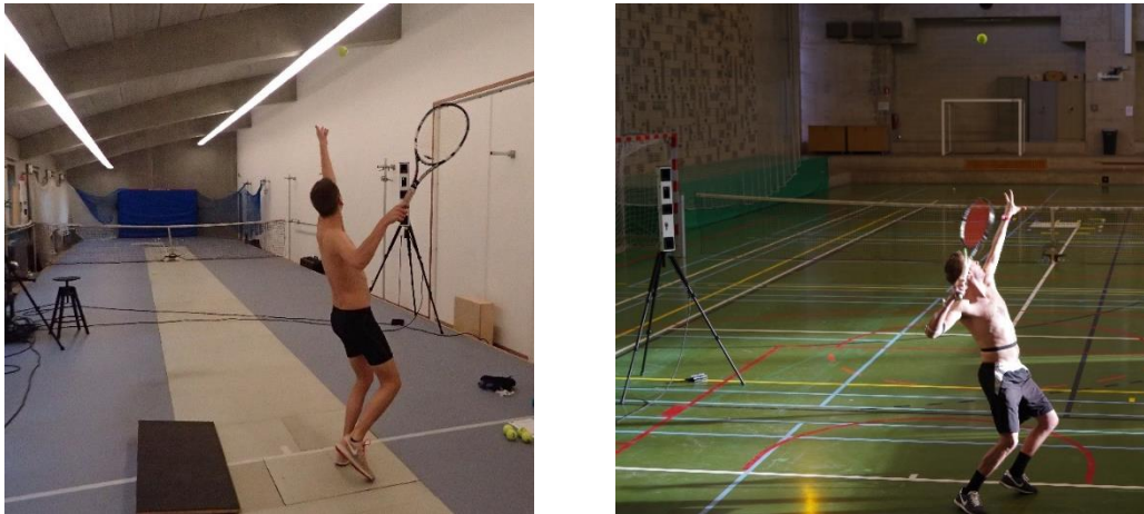
Figure 1: A. Laboratory; B. Official tennis court

set to better represent the situation encountered in other studies (Tubez, 2015). The markers were placed in accordance with the recommendations of the International Biomechanical Society (ISB) (Wu and al. 2002; Wu and al. 2005). The acquisition rate was equal to 200 Hz.