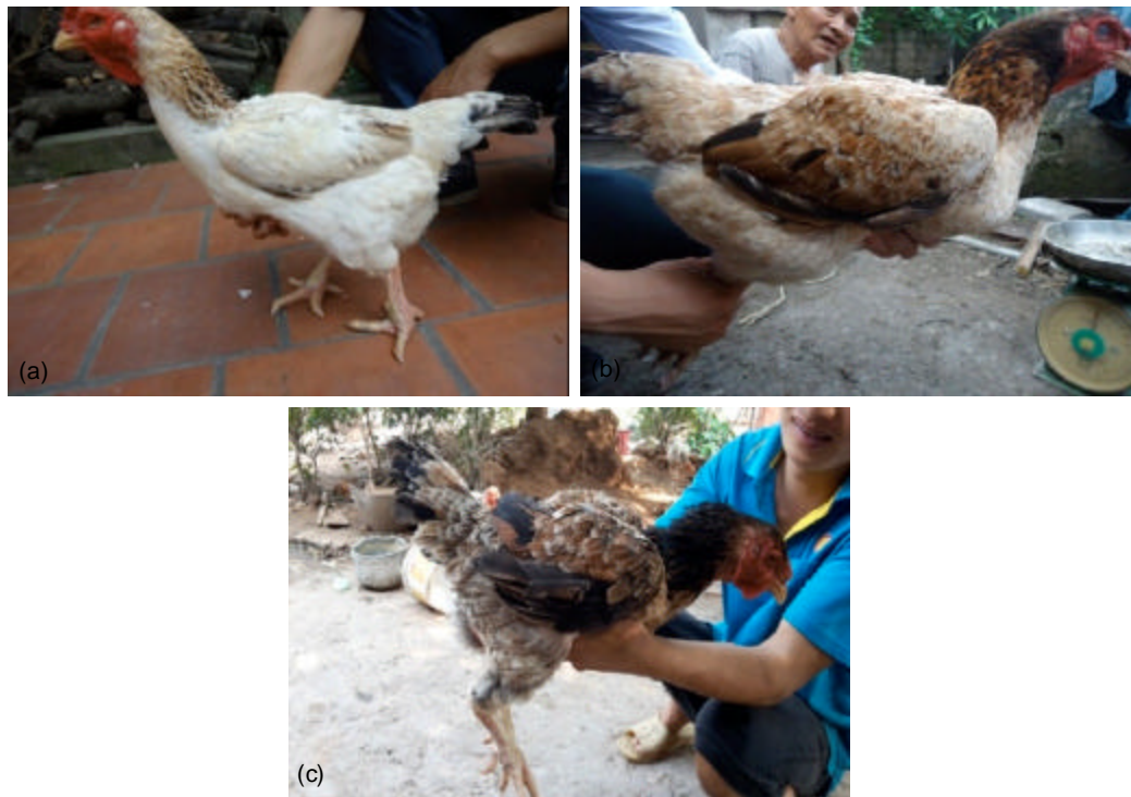
Fig. 2(a-c): (a) Wheat color feather, (b): Tan color feather, (c): Tri color feather

Ho chickens had 2 main beak colors: the dark (Fig. 5a) and the yellow (Fig. 5b). The frequency of occurrence of these colors was also different between males and females. In the males, the two colors occurred with equal frequencies whereas yellow beaks were observed in most females (91.09%).