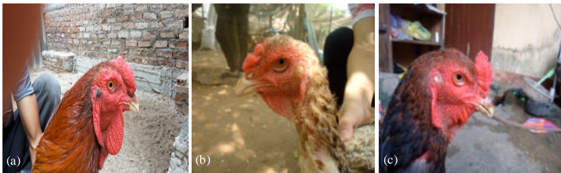
Fig. 4(a-c): (a) Walnut comb, (b): Strawberry comb, (c): Pea comb