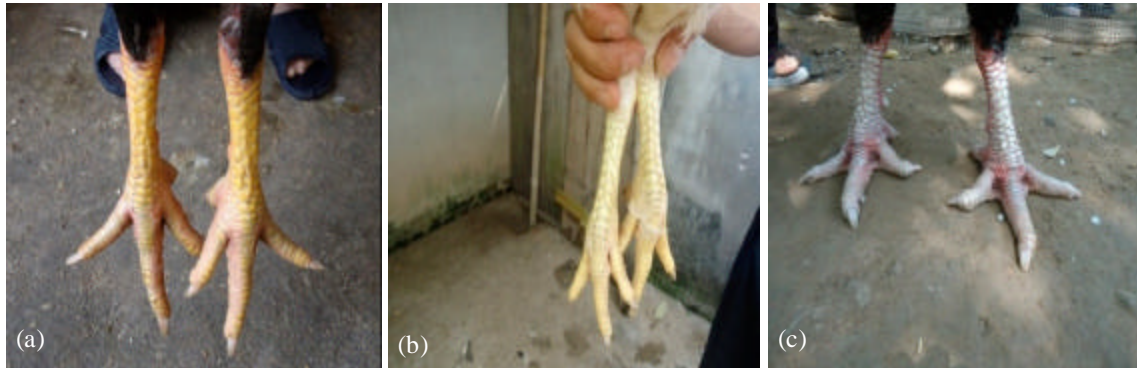
Fig. 3(a-c): (a) Yellow red toe, (b): Yellow toe, (c): White red toe