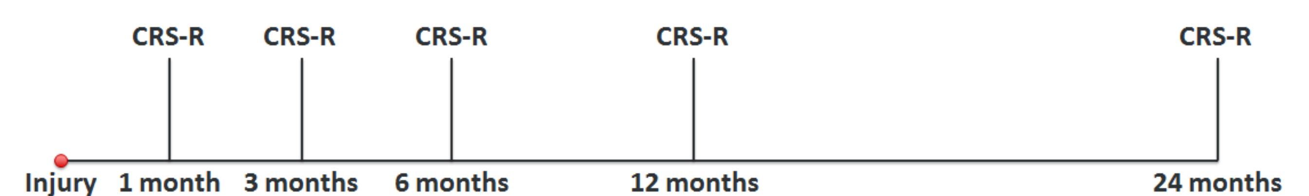
Fig. 1. Patients were assessed at 1, 3, 6, 12 and 24 months post-injury with the Coma Recovery Scale-Revised 5 .

We collected demographic information, acute care history and longitudinal follow-up of patients in UWS/V S and MCS admitted in 15 expert centers in Belgium (via the Belgian Federal Public Service Health) (Fig. 1). The diagnosis was based on internationally accepted criteria of UWS/V S , MCS or EMCS. Results were considered significant at p<0.001.