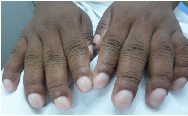
Figure 2 Digital clubbing in primary hypertrophic osteoarthropathy.

(HPGD) and solute carrier organic anion transporter family member 2A1 ( SLCO2A1 ) genes.