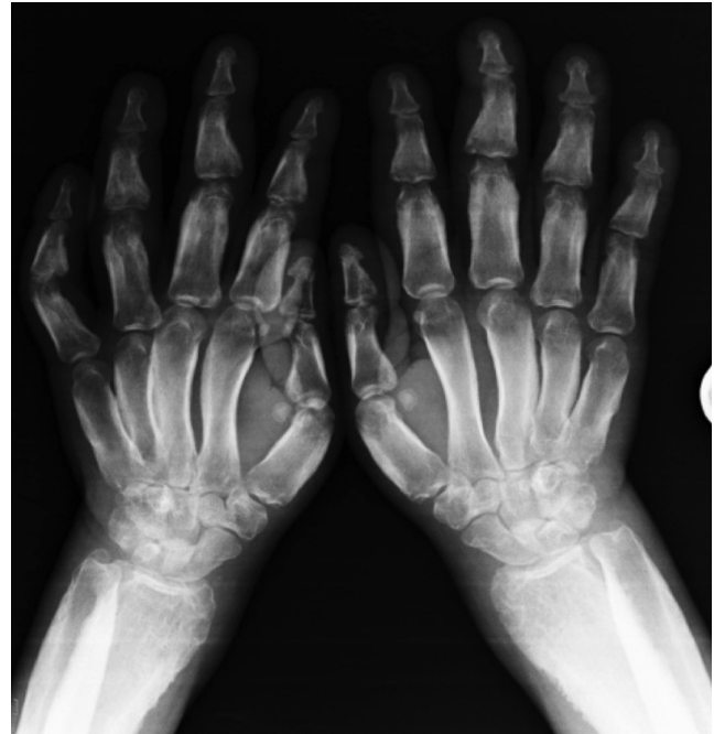
Figure 4 Typical radiological features of the distal upper limb and hands of a patient with primary hypertrophic osteoarthropathy showing increased density of the carpal, metacarpal and phalangeal bones with reduction in joint spaces and soft tissue swelling.

Once a diagnosis of acromegaly had been discounted and the multifocal bone and joint disease diagnosed, he was treated with oral bisphosphonate therapy and regular non-steroidal anti-inflammatory drugs to reduce pain and inflammation.