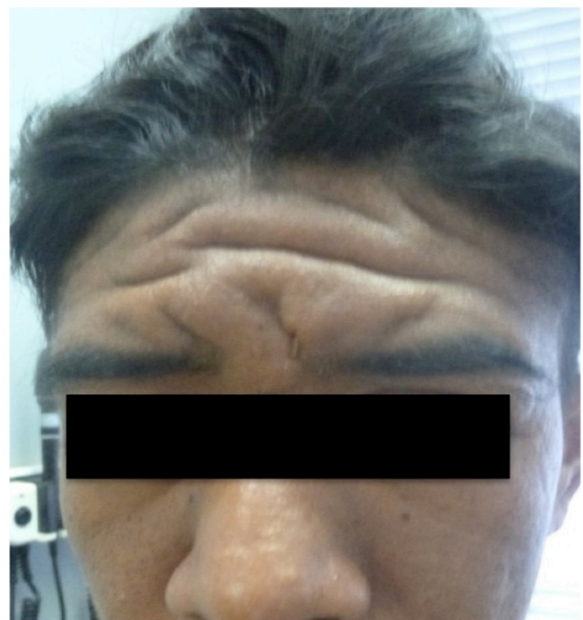
Figure 1 Facial changes in primary hypertrophic osteoarthropathy demonstrating thickened oily skin and excessive folding of the skin of the forehead (cutis verticis gyrata).

Radiologic studies of his limbs demonstrated subperiosteal bone formation with bone density and cortical thickening (Fig. 3). Hand radiographs revealed similar subperiosteal bone formation, phalangeal thickening and decreased joint spaces at the carpus (Fig. 4). The knees showed bony excrescences in the patellae and involvement of the proximal tibia and distal femur with calcification and signs of effusion. A lateral radiograph of the skull demonstrated a normal sella with hyperostosis of the skull bones (Fig. 5). The patient had no signs of pulmonary disease, and PHOA was diagnosed. Given the known genetic causes of PHOA, the patient underwent sequencing of the hydroxyprostaglandin dehydrogenase