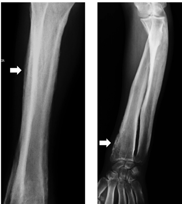
Figure 3 Periosteal new bone formation (periostosis) in the tibia and radius (white arrows) with associated cortical thickening.