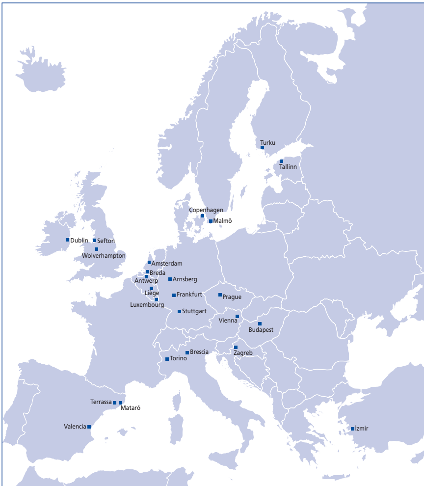
Figure 1: CLIP network cities covered in this report

The 25 cities that participated in this module (and shown on the map in Figure 1) are: Amsterdam (Netherlands), Antwerp (Belgium), Arnsberg (Germany), Breda (Netherlands), Brescia (Italy), Budapest (Hungary),