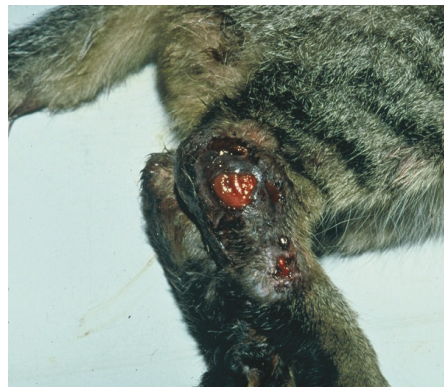
Figure 4 Ulcerative lesions on the hind limb of a cat with sporotrichosis.