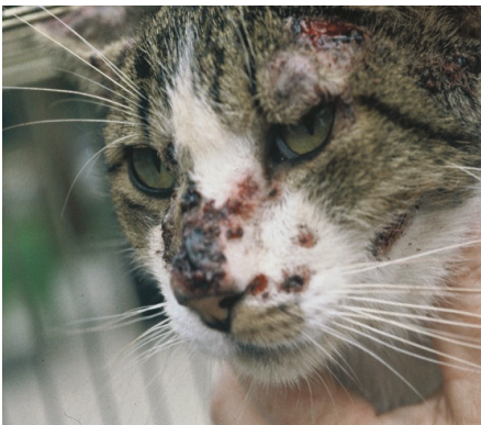
Figure 2 Ulcerative crusted facial lesions in a cat with sporotrichosis.

Blood abnormalities (anaemia, leukocytosis, neutrophilia, hyperglobulinaemia and hypoalbuminaemia) reported in cats with feline sporotrichosis are non-specific, and consistent with a chronic inflammatory condition. 14