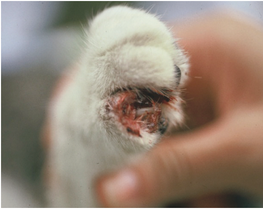
Figure 1 Ulcerative lesions around the claw in a cat with sporotrichosis.

retrospective study of 23 cases in various mammalian species in California, the cat was the most commonly affected (14 out of the 23 cases). 10 In Central and South America, however, sporotrichosis represents the most common deep mycosis. In Brazil it is endemic, and an important epidemic outbreak affecting humans, cats and dogs has been reported from Rio de Janeiro. 2,5,11