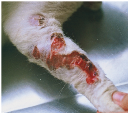
Figure 3 Multiple ulcerative crusted lesions on the forelimb of a cat with sporotrichosis.