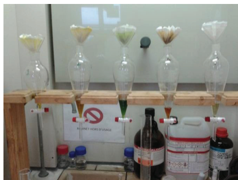
Figure 1. Lipid Extraction Process

For lipid extraction a slightly modified previously reported protocol utilizing 2:1 chloroform/methanol (Folch et al., 1957) was adopted. Supernatant was collected three times after repeated cycle of washing 5 g ground seeds with 25 ml of solvent subjected to 10 min of handshaking and then to centrifugation for 10 min at 1800 g in Avanti J-E (Beckman Coulter Inc., Belgium). This supernatant was filtered (5 µm Whatman filter paper, Sigma-Aldrich Company, Belgium) and collected in a 250 ml separation funnel. The washing of the filter paper was done using the same solvent until the solution in separation funnel was 160 ml. Following this 40 ml of 0.58 % NaCl solution was added in the funnel. The mixture was thoroughly mixed and allowed to stand overnight (Figure 1). The lower phase was then collected and 40 ml chloroform was added to the funnel. After standing for 5 hours, again the lower non-aqueous phase was removed. The solvent from this non-aqueous phase was removed by RE-121 Rotavapor (BUCHI Labortechnik GmbH, Netherlands) and nitrogen flushing. The seed residue left after lipids extraction was store at -20 °C and later analyzed for protein content using same method mentioned above.