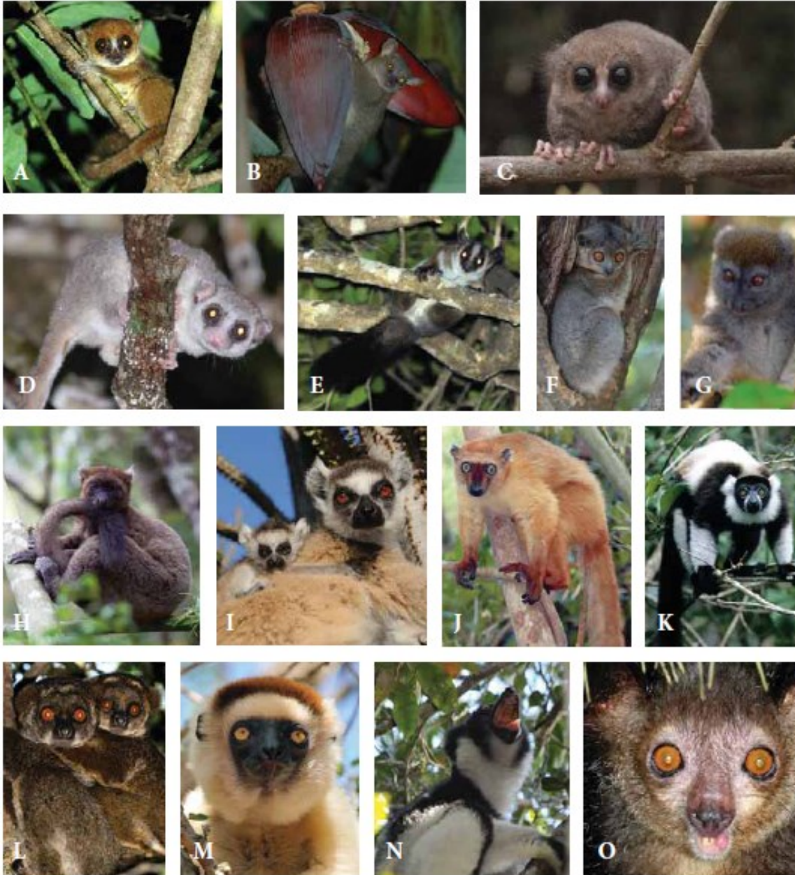
Illustration of the 15 genus of lemurs