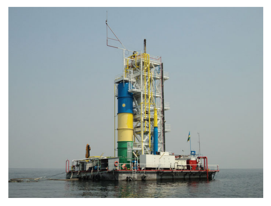
Fig. 1.4 Gas extraction facility of Kibuye Power 1 (KP1), the first pilot plant for large-scale commercial methane extraction from Lake Kivu that started operating in January 2009

fish diversity, biomass and production are described in Chaps. 7 and 8, respectively. Comparisons are made with other African Great Lakes, highlighting the low diversity and the simplified food web of Lake Kivu, with however a high proportion of endemic fish species.