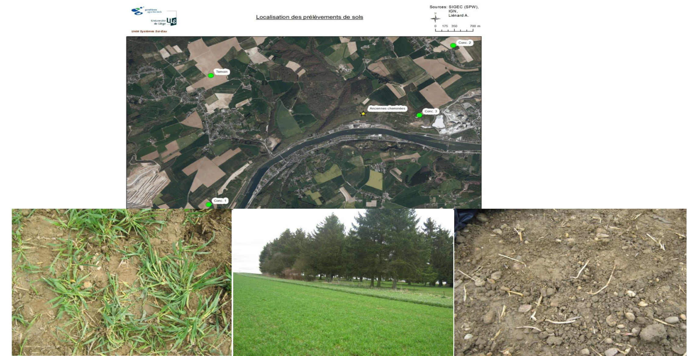
Metalliferous grassland of Sclaingneaux calaminary site

With industrialization and mining, heavy metals pollution of soil has become a serious environmental problem. Among metallic trace elements (MTE), cadmium (Cd), lead (Pb), zinc (Zn) and copper (Cu) are receiving extensive attention because of toxicological effects on plants and animals. Z. mays and V. faba plants are relatively sensitive to metals. Earthworms play a key role in terrestrial ecotoxicological risk assessment. The original aspect of this experiment consists in the utilization of industrial polluted soils. In this way, a cocktail of metals could be studied, to carry out complementary ecotoxicity tests. In order to gain better understanding of the metal uptake by plants in the presence of earthworms, the aims of this study are to : (1) evaluate the effects of a gradient of metal contamination on life cycle parameters of Eisenia fetida ; (2) assess the impact of E. fetida on metal bioavailability and on the properties of the soil (3) assess if the addition of E. fetida lead to metal accumulation in Vicia faba and Zea mays plants. Then, earthworm and plant metal bioaccumulation studies will be performed to better understand the effects of earthworms on the phytoremediation by two plants.