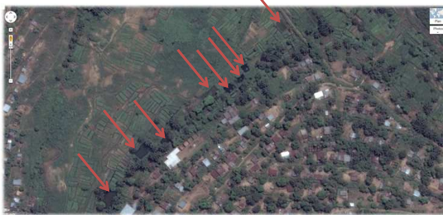
Figure 2. Satellite image of the Funa valley (Urban 1, Mont-Ngafula)