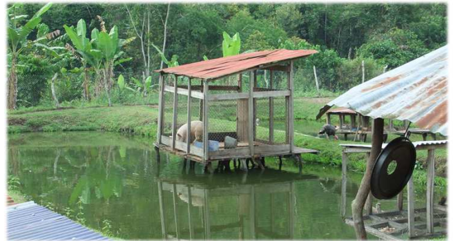
Figure 1. Pig and fish pond in Mbankana