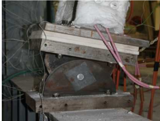
Figure 1. Hinged support

The hinges were assumed to provide no restraint to rotation around one axis while preventing the rotation around the perpendicular axis. Preliminary numerical simulations performed with shell finite elements of the code SAFIR[2] showed that such support conditions were sufficient to induce failure in the direction of the strong axis of the section; no torsional compression buckling or buckling in the direction of the weak axis would occur (except when this is desired and the section is turned by 90 degrees). It was thus not necessary to provide mechanical means of lateral restraint that would have divided in two the buckling length in the direction of the weak axis.