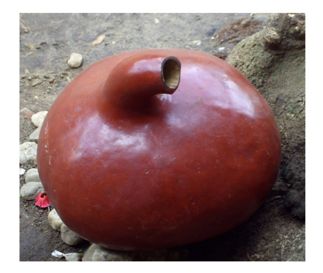
Figure 2. A traditional butter churn or igisabo — Une baratte traditionnelle ou igisabo.

Milk stored in a small gourd will ferment to give kivuguto milk, which is then used in this liquid form. On the other hand, when milk is left to ferment in a large gourd ( igisabo ), or in a calabash ( Figure 2 ), additional processing is applied to the resulting kivuguto milk. Here the kivuguto is churned to produce kimuri (butter) or amacunda (buttermilk). In order to produce these products, the kivuguto is first of all stirred