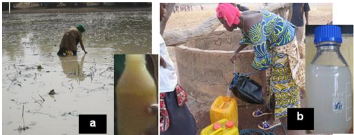
Figure 2: Aspects of drinking water at the sites of Gana and Boaré in the Sourou valley during the study period. Water sample from Gana River (a) and the modern well of Boaré (b)