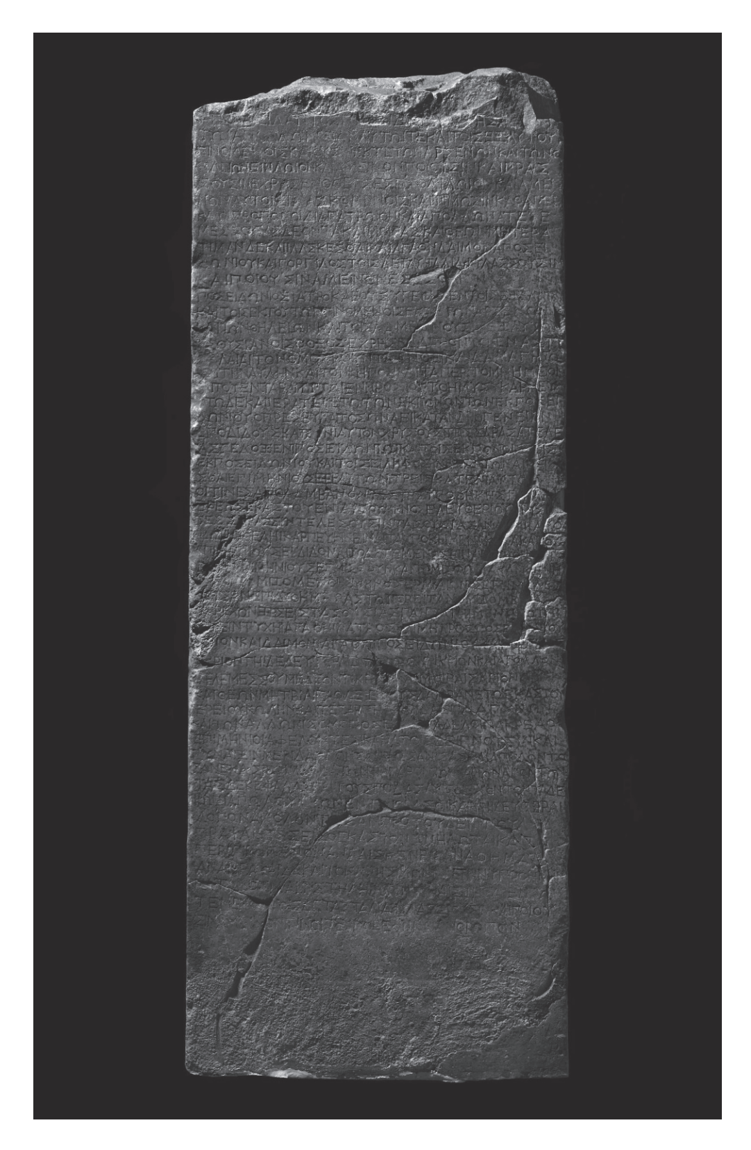
Fig. 2 Stele of Poseidonios from Halicarnassus (© Trustees of the British Museum, inv. no. 1876,0701.1)