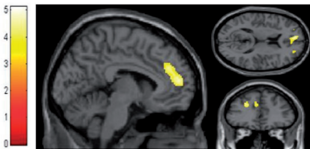
Fig. 2 Brain-behavior correlation between anosognosia discrepancy scores and FDG-PET images in AD patients compared to elderly controls shows significant hypometabolism in the dMPFC. Images are displayed in the Montreal Neurological Institute (MNI) space. SPM displayed at P < 0.0005 uncorrected.

The stereotactic coordinates refer to the MNI space. AD and EC refer to Alzheimer's patients and elderly control subjects. The SPM{T} maps were thresholded at P < 0.0005 at peak level and P_{\text{FWE}} < 0.05 at cluster level.