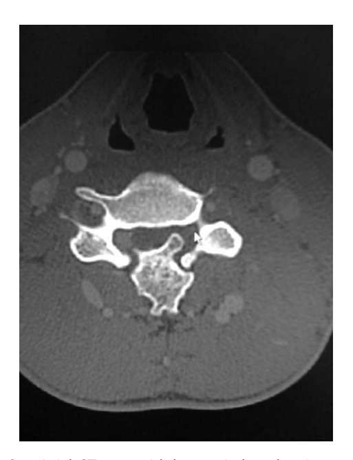
Figure 2 Axial CT scan with bone window showing an osteochondroma measuring 22 mm in anteroposterior length and 17 mm in width, developing at the expense of the posterior arch of C4 and entering the spinal canal.

Surgery enabled complete excision of the tumor by simple laminectomy from C3 to C5. There were no adhesions with the dura mater. The procedure provided release of the dural sheath. The histology examination concluded in osteo-