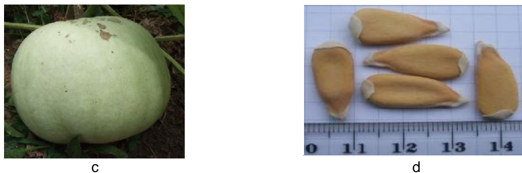
Figure 1: Fruit of “blocky-fruited cultivar” (a) and its seeds without cap (b); fruit of “round-fruited cultivar” (c) and its seeds with a cap on a distal side of the oleaginous Lagenaria siceraria

Obtaining various aged fruits: Each of the two cultivars (BFC and RFC) of Lagenaria siceraria was grown during two rainfall seasons (from March to June 2007 and from April to July 2008) in an isolated field at the experimental farm of University of Abobo-Adjamé (Abidjan, Côte d’Ivoire). To obtain vigorous seedlings, then good yield, both fields were pre-fertilized with pig manure. These fields were regularly maintained by three weedings and one insecticidal treatment (Cypercal 50 EC). Approximately 150 pistillate flowers of each cultivar were tagged at anthesis, and 15 fruits which developed from them were manually harvested by simple rupture of stalk at 30, 40 and 50 days after anthesis (DAA).