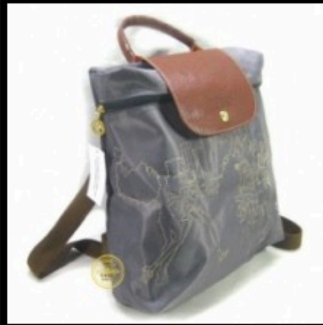
Longchamp printemps 2012 et l'été gris nouvelle