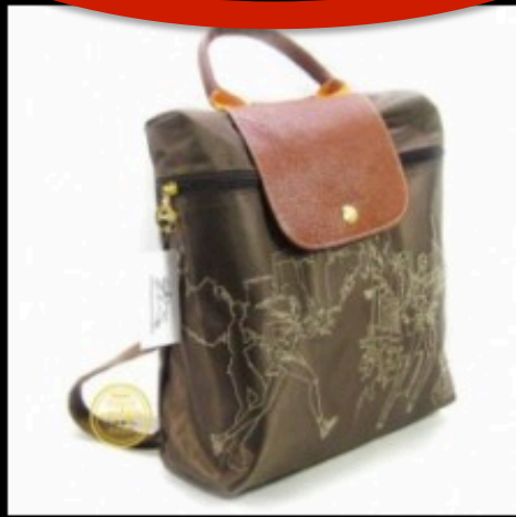
Longchamp 2012 nouveau café printemps et en été