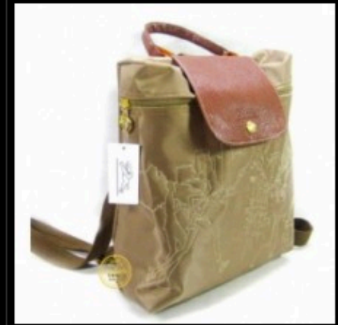
Longchamp printemps 2012 nouvelle et brunes d'été