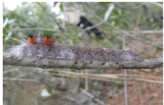
Figure 2. Borocera cajani larvae in 5 th instar — Larve de stade 5 de Borocera cajani .

Borocera cajani colonizes the U. bojeri (or “Tapia”) forest, which is found in the central highland