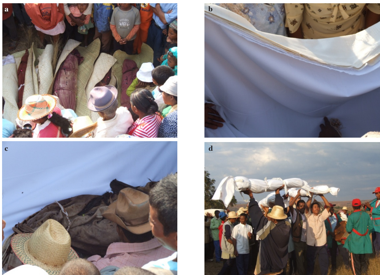
Figure 5. Wrapping during the “Famadihana” in Arivonimamo, 2009 — Enveloppement de dépouilles mortelles pendant le « Famadihana » à Arivonimamo, 2009.

a: mortal remains out of the grave — dépouilles mortelles exhumées ; b: shroud made by Bombyx mori — linceul fait à partir de Bombyx mori ; c: wrapping — enveloppement ; d: dance with mortal remains wrapped in silk shrouds — danse avec les dépouilles mortelles placées dans les linceuls en soie.