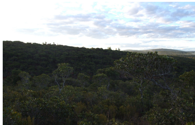
Figure 4. Uapaca bojeri forest in Arivonimamo, 2009 — Forêt de Uapaca bojeri à Arivonimamo, 2009.

zones (Imamo, Itremo) and Isalo zones of southwest of Madagascar (Gade, 1985). The “Tapia” forest constitutes one of the naturally formed forests of the island, primarily containing just one tree species, U. bojeri (Rakotoarivelo, 1993; figure 4 ). This plant