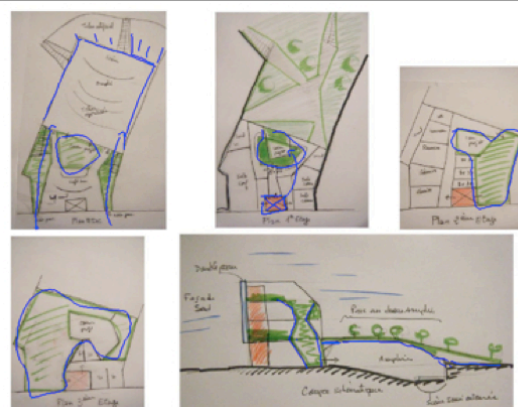
Fig. 4 : identification of the "heart of the project" (in blue) with digital annotations on previous documents (scanned pen-and-paper sketches).

A second function, close to the previous but however different, consists in putting in correspondence elements present in several documents . Thus, the annotations do not only support the speech, but also help to make connections between multiple representations, on a graphics mode. In the illustration below (Figure 4), the designer, explaining its partners the principles underlying its construction, explicitly shows on five drawings where is the "heart of the project." This function is supported by highlighting or pointing annotations. No new information is specifically added on the document, but this mapping can convey a specific message, namely the identification of several drawings of a common concept.