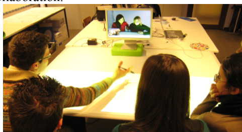
Fig. 3 : meeting on the DCDS

The system is completed by a 24-inch screen with an integrated camera, which allows the participants to see and talk to each other, on an almost 1:1 scale, during a real-time conference. Pointing, annotating and drawing are possible due to the electronic pen. Social exchanges are transmitted through the external modules of video-conferencing in order to support the vocal, the visual and the gestural aspects of the collaboration.